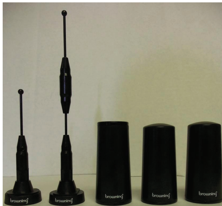
BR-2233 BR-2235 BR-2425 BR-2445 BR-2480 BR-2483